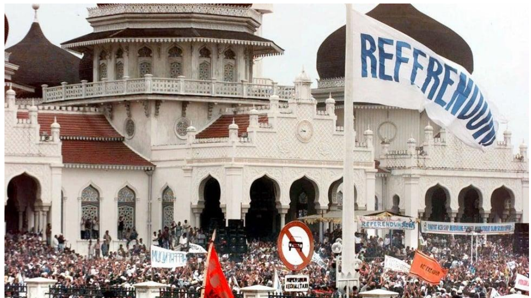
Figure 3: Public Gathering during Referendum Movement